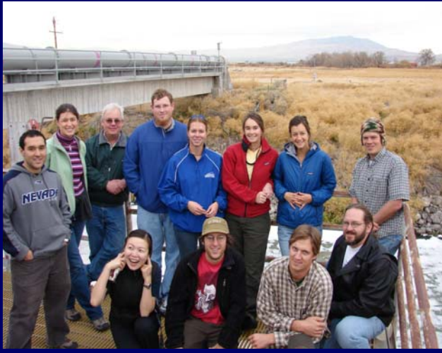
AWRA Student Members on the TMWA field trip.

The UNR student chapter of the American Water Resources Association, or AWRA, has been going through a renaissance this fall semester. After a stint of relative inactivity, AWRA has regrouped and is attempting to unite UNR students who are interested in water resources in a relaxed social setting. Concession sales at UNR football games have helped to raise funds for the group that will finance future AWRA activities. Recently, AWRA organized a field trip to the Truckee Meadows Water Reclamation Facility (TMWRF) with 12 UNR students attending. The microbial processes of water reclamation employed by TMWRF and the technology behind the processes was a fascinating experience. It was encouraging to learn that treated water leaving TMWRF and entering the Truckee River was of a quality better than most treated water in America.