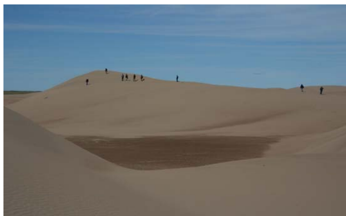
Conference attendees exploring a dust source near Puerto Madryn, Argentina. The ranch owner had an incredible collection of hundreds of arrowheads that have been found in desert pavement,

Aside from talking about dust at the conference, we also talked about dust while drinking cervezas, and while doing some whale watching. U.S. politics was also a popular topic of conversation. We even explored some large dust emitting sand dunes on a quaint sheep ranch nearby. In sum, I had a nice time full of new experiences, expanding both my scientific and cultural horizons. Viva Argentina!